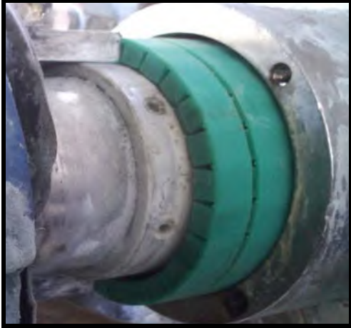
Place PCK as shown to compress each ring into the stuffing box.