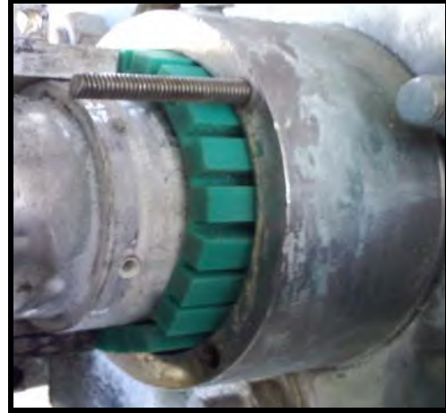
For small rings ONLY, the PCK may be placed as shown.