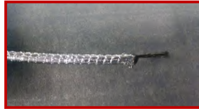
Inconel® can be clearly seen knitted around each individual yarn

Slade utilizes Inconel® 600 as a knitted jacket around our patented carbon reinforced yarns. Slade's unique design allows the Inconel® to become an internal skeleton providing strength and stability with out damaging equipment.