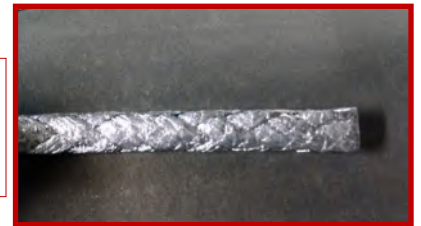
After packing is braided and calendared to size, Inconel® knit becomes less visible as the graphite is pushed out through the Inconel®