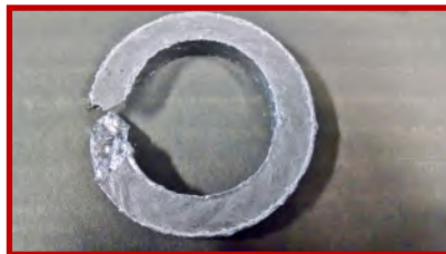
Once die formed, the Inconel® knit is no longer easily visible due to the carbon fiber strands pushing out the graphite up and over the Inconel®

Slade's unique patented yarns include a continuous carbon core within the center that allows the structure to hold up under high temperatures, pressures and chemicals. The carbon core provides resilience for thermal cycling.