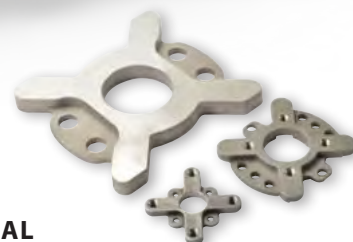
UNIVERSAL MOUNTING PLATES